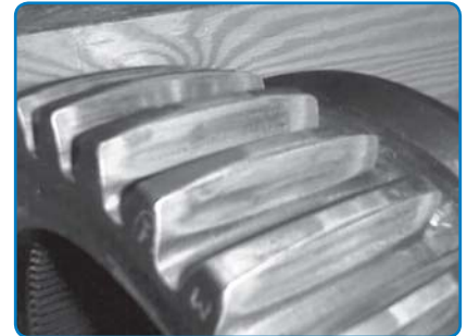
Same spindle after one year with Syn-Tech grease.