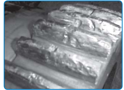
High speed cold mill with typical soap Molybdenum Disulfide after one year.

The graph below shows the temperature difference measured in a gear coupling that used Molybdenum disulfide spindle grease vs. Syn-tech grease. The graph shows 30-60 degrees different in operating temperature with the use of Syn-Tech 3913G grease. Temperature is critical for successful operation. The higher the temperature the faster the grease breaks down and tooth distress occurs. Operating temperature above 250 degrees F usually present premature tooth distress problems for gear type couplings.